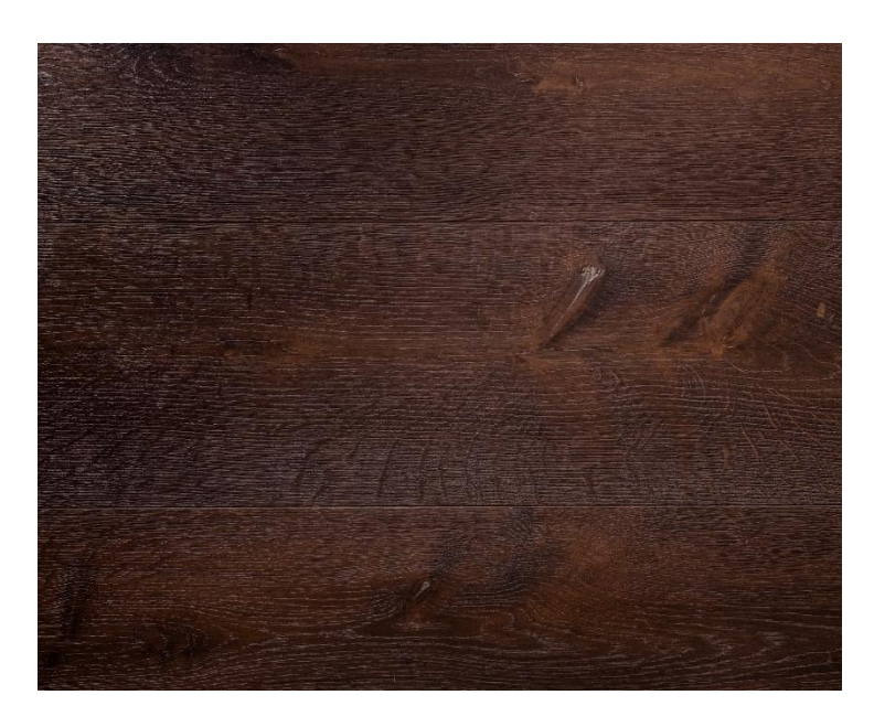
STUDIO - NIGHT

Studio Night is a European White Oak treated with a dark, rich, fuming treatment to create a beautiful dark brown floor.